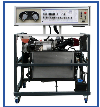
Order Nr. MVTSI 1